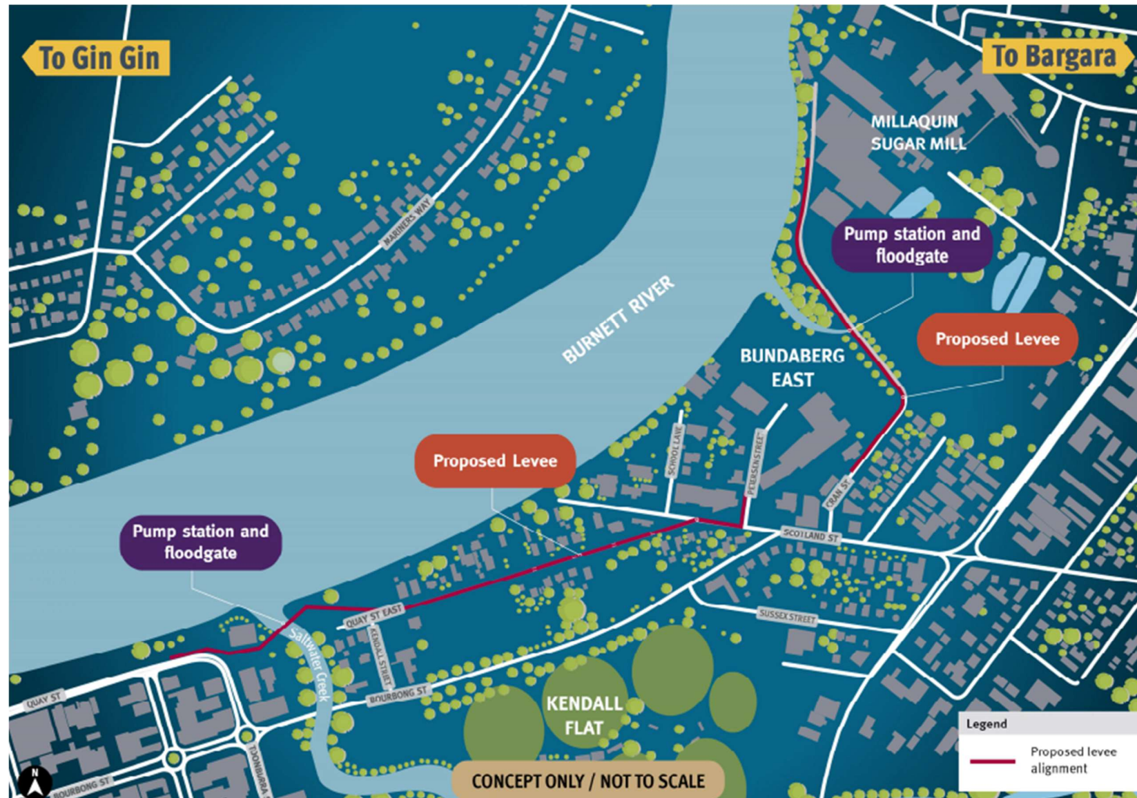
Figure 1: Bundaberg East Levee – Concept Design Location Plan (NTS)