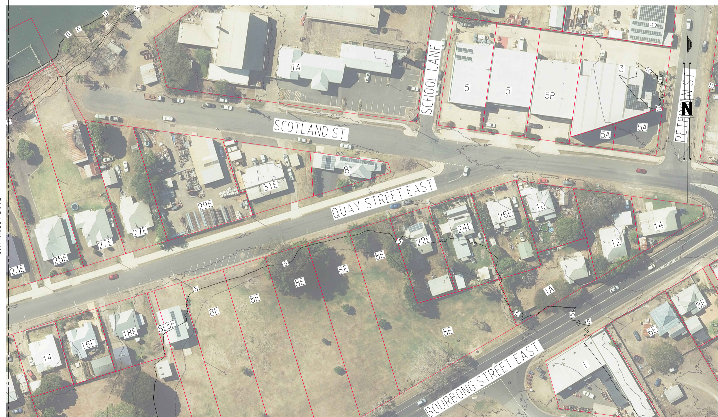
CITY CONTOUR PLAN 1:1000